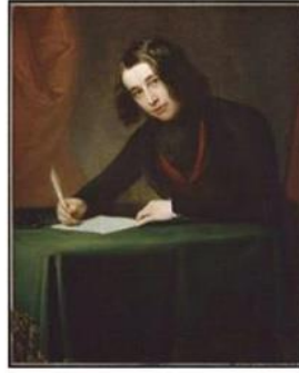
Charles Dickens (1842)